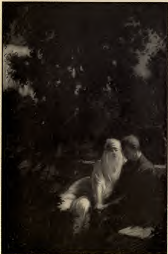
Her loose white robes splashed with the molten silver of the moon.